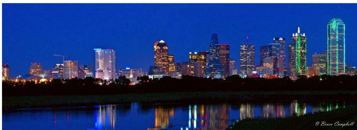
"Dallas Skyline,"

Campbell & Chadwick, P.C. was founded in December of 2003 as a firm dedicated to the legal representation of businesses and professionals. Since then, the firm has achieved a reputation for excellence in the legal and business communities. Today, more than 100 insurance companies, professionals and businesses turn to Campbell & Chadwick, P.C. for legal counsel and representation.